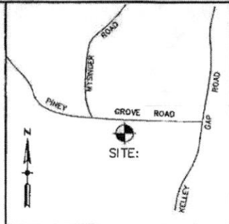
LOCATION MAP NTS